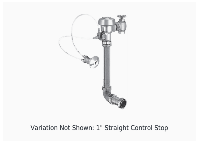
Variation Not Shown: 1" Straight Control Stop